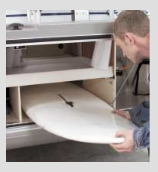
Not to mention the things you don't see: like full insulation for winter use. HYMER body shells are based on the patented HYMER-PUAL technology.