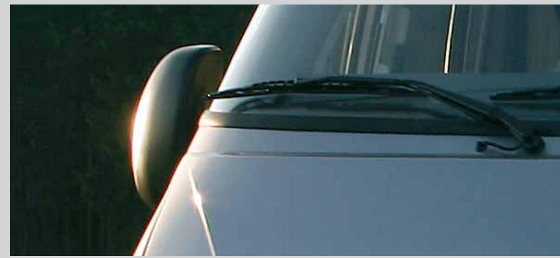
HYMER Van HYMER EXSIS